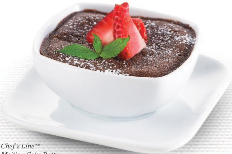
Featuring Chef's Line™ Chocolate Melting Cake Batter